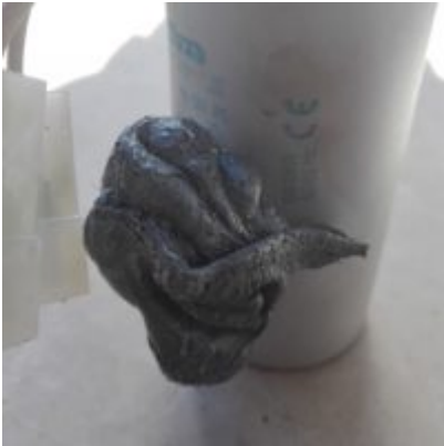
mbsm-dot-pro-capacitor-explodes- Pictures-I.jpg (2 MB)