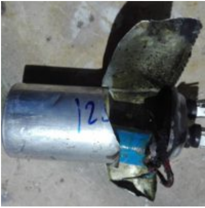
mbsm-dot-pro-capacitor-explodes- Pictures-B.jpg (3 MB)