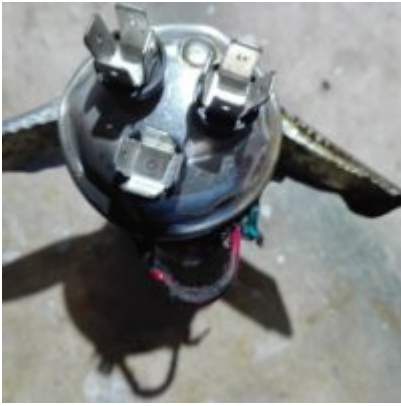
mbsm-dot-pro-capacitor-explodes- Pictures-D.jpg (3 MB)