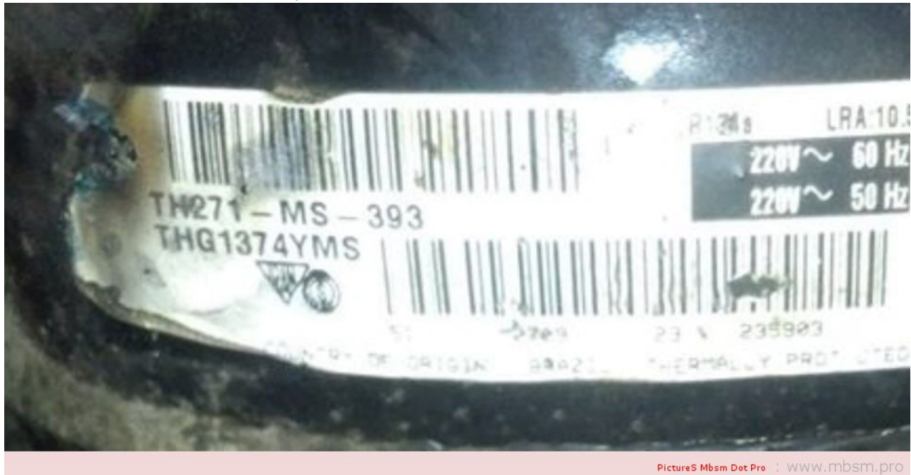
Compressor ,TECUMSEH 1/4HP ,THG1374YS, R134A ,tm271-ms-393

Category: Technologie,Tester ok written by www.mbsm.pro | 30 January 2026