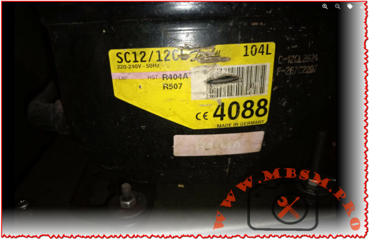
Mbsm.pro, Compressor, SC12/12CL, 104l 4088, Compressor twin, SECOP, 104L4088, R404A/R507, 3/8 hp, mhbp

Mbsm.pro, Compressor, SR075Z, 1/5 hp++, lbp, r134a, refrigerator COLDEX , Equivalent, Cubigel GL75AA, ACC , GVM66AA, AS80, Embraco FFI7.5HAK, EMT60HLP, NBT1116Z, Secop, TLES6.5FT.3