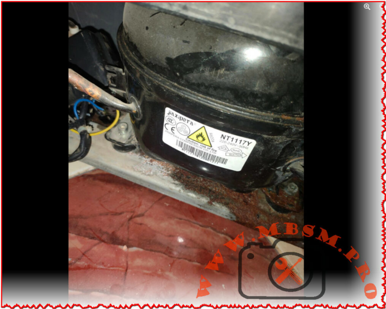
Mbsm.pro, refrigerator, RD-73WS4S, Hisense, 597 L, R600a, 58 g, 230 w, Compressor, Nt1117y, 1/4 hp

Mbsm.pro, refrigerator, TPA1410YXC, KIRIAZI, no frost, 635 L, r134a, 180 g, Compressor, TPA1410YXC, 1/4 hp++