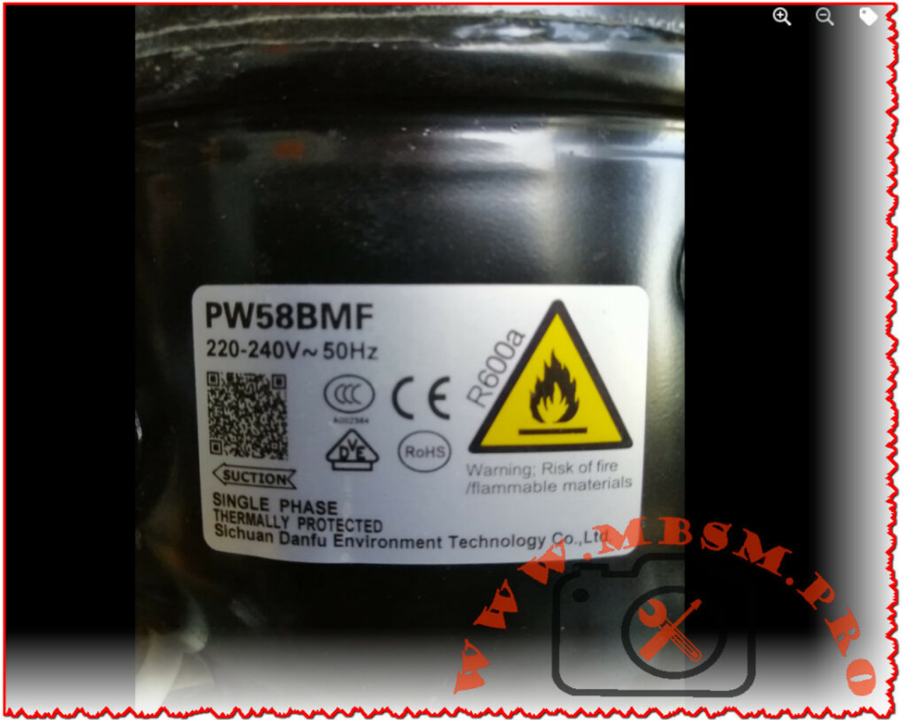
Mbsm.pro, Refrigerator, ref-88-04, Newal, BRANDT, W433253, 68L, 100W, r600a, 27g, Compressor, PW58BMF, 1/8 hp, lbp