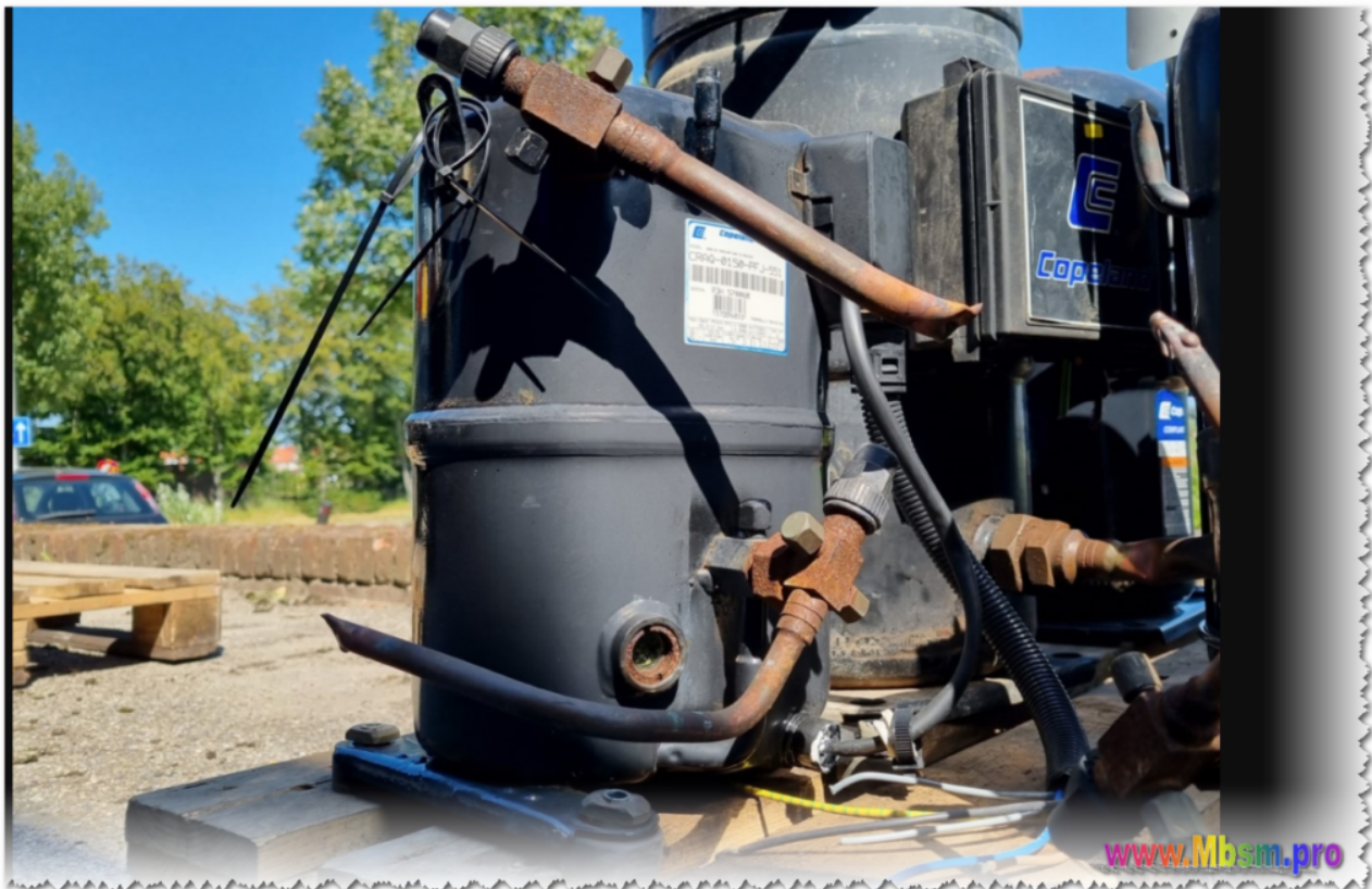
Copeland™ Three Phase Compressor Models