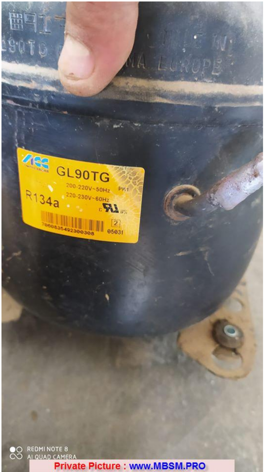
Danfoss Refrigeration, R134a, GL90TG, 220-240V 50-60Hz, R134A, HBP, CSIR, compressor Haute pression avec condensateur