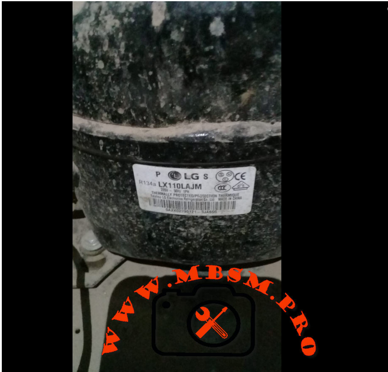
1/2HP, LG, Commercial, Freezer, Compressor ,Lx110lajm, SC21G, r134a

Mbsm.pro, compressor , Embraco, EGUS 80HLP, EGUS80HLP, lbp, 1/4 hp, r134a