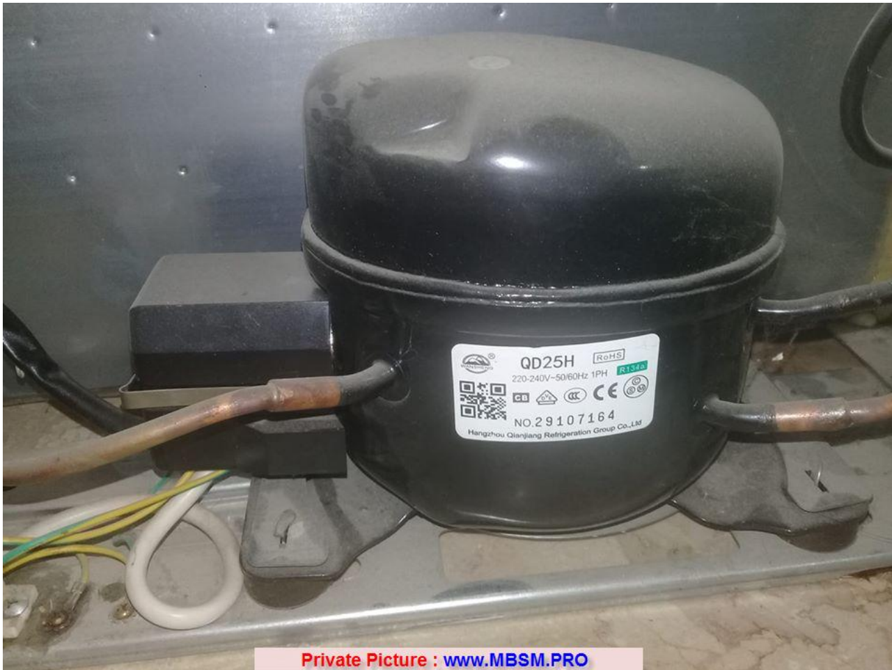
Compressor ,1/12Hp ,Qd25h R134a,1/12HP ,62/72W

COMPRESSOR, EMBRACO , fgs130ha, LBP (Low Back Pressure) ,RSCR ,316 W ,1/3+ HP ,220-240 V 50 Hz ,1080 Btu/h ,11,14 c.c.,R134a