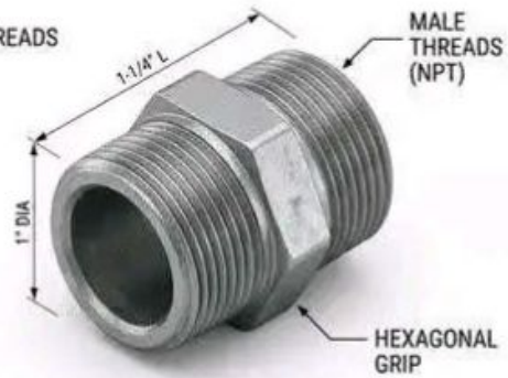
(2) HEX NIPPLE