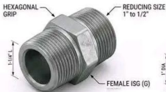
(3) REDUCER HEX NIPPLE