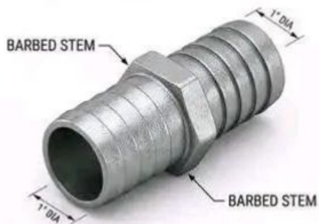
(5) HOSE NIPPLE