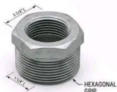
(6) HEX BUSHING