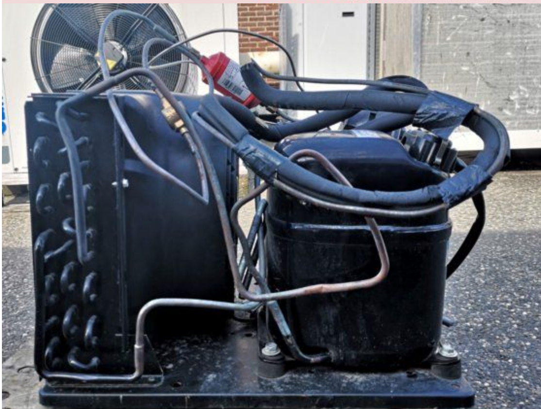
Private Picture Copyright : WWW.MBSM.PRO