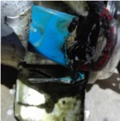
mbsm-dot-pro-capacitor-explodes- Pictures-G.jpg (2 MB)