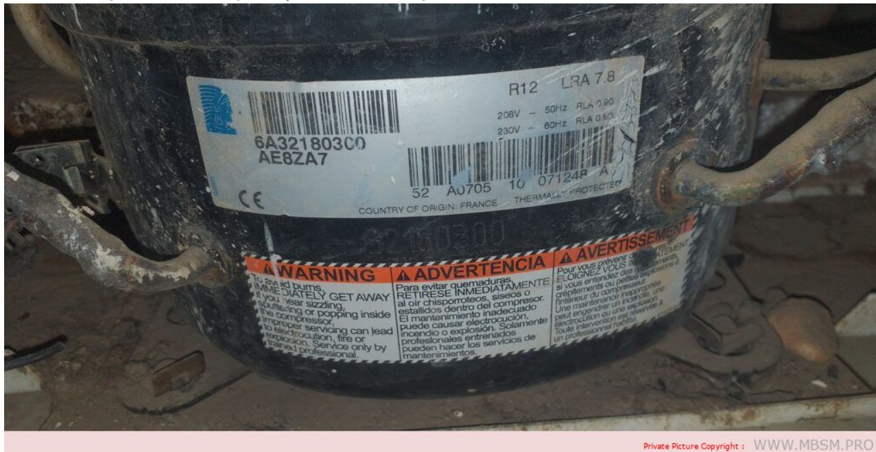
Compressor BPM1084Z, B1085A, AE8ZA7: A Comprehensive Overview

written by www.mbsm.pro | 11 February 2026