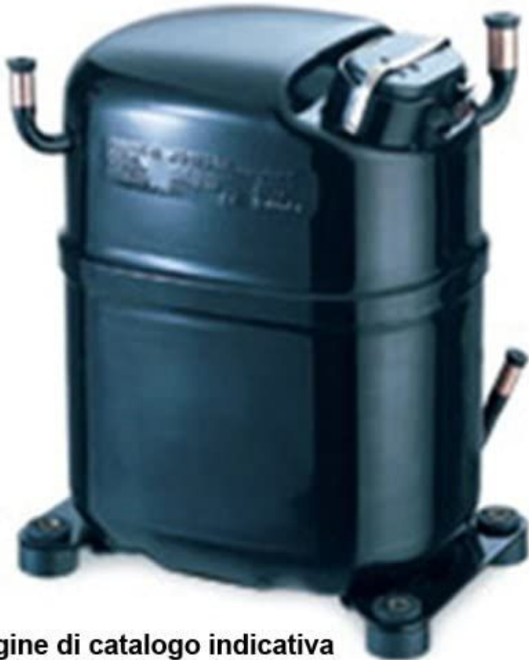
Immagine di catalogo indicativa

written by www.mbsm.pro | 2 February 2022