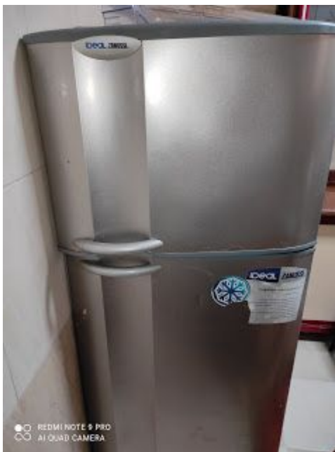
Private Picture Copyright: WWW.MBSM.PRO