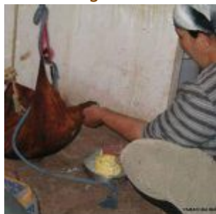
le-tirage-du-beure1.jpg (67 KB)