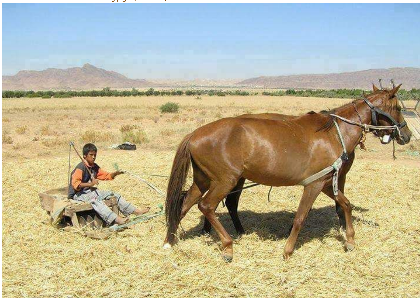
la-recolte-de-blee-1.jpg (76 KB)