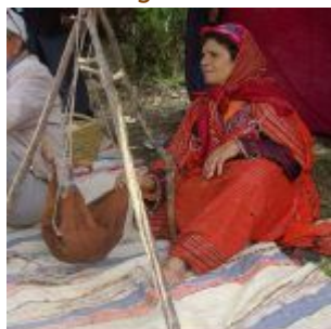
le-tirage-du-beure.jpg (123 KB)