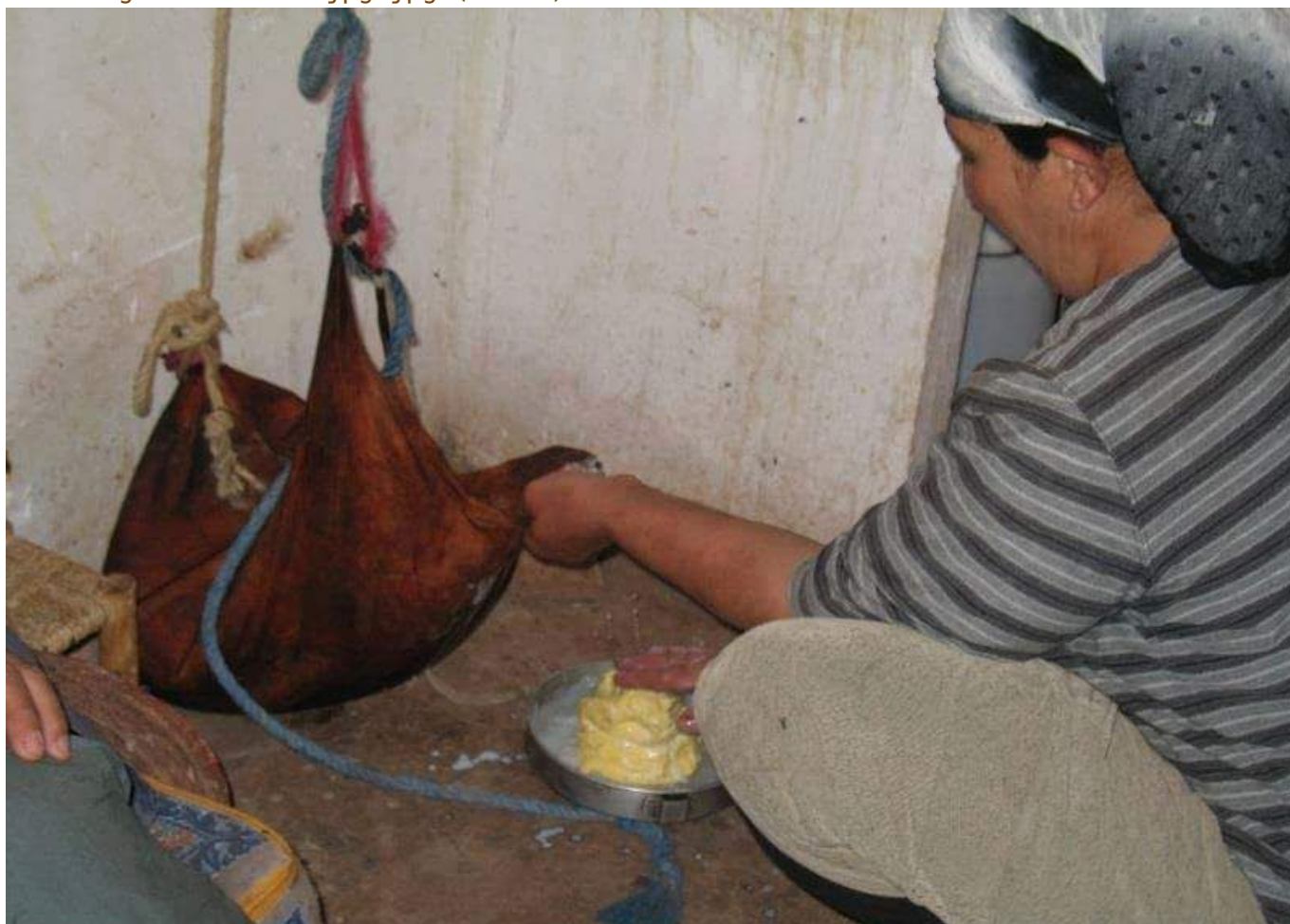
le-tirage-du-beure.1jpg.jpg (50 KB)