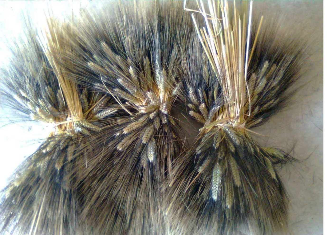
la-recolte-de-blee.jpg (168 KB)