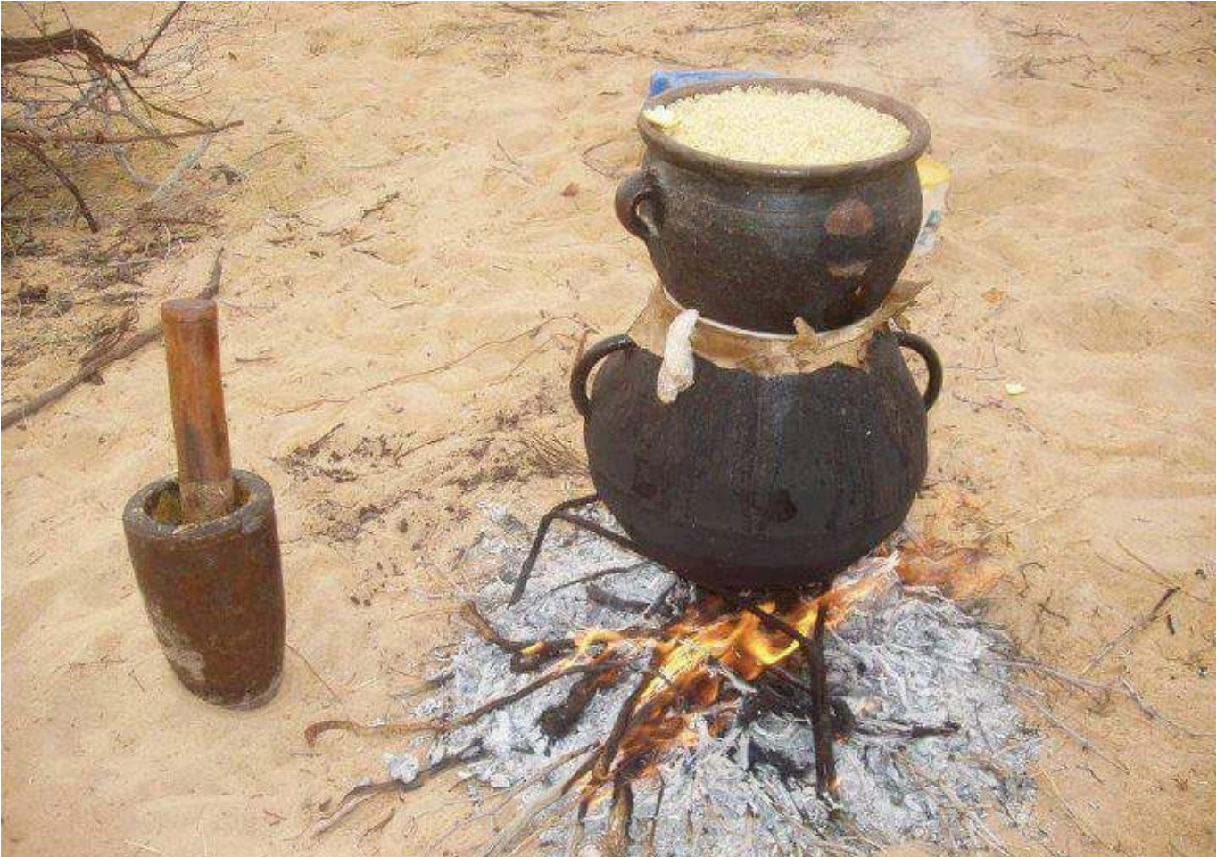
le-couscous-tunisien.jpg (74 KB)