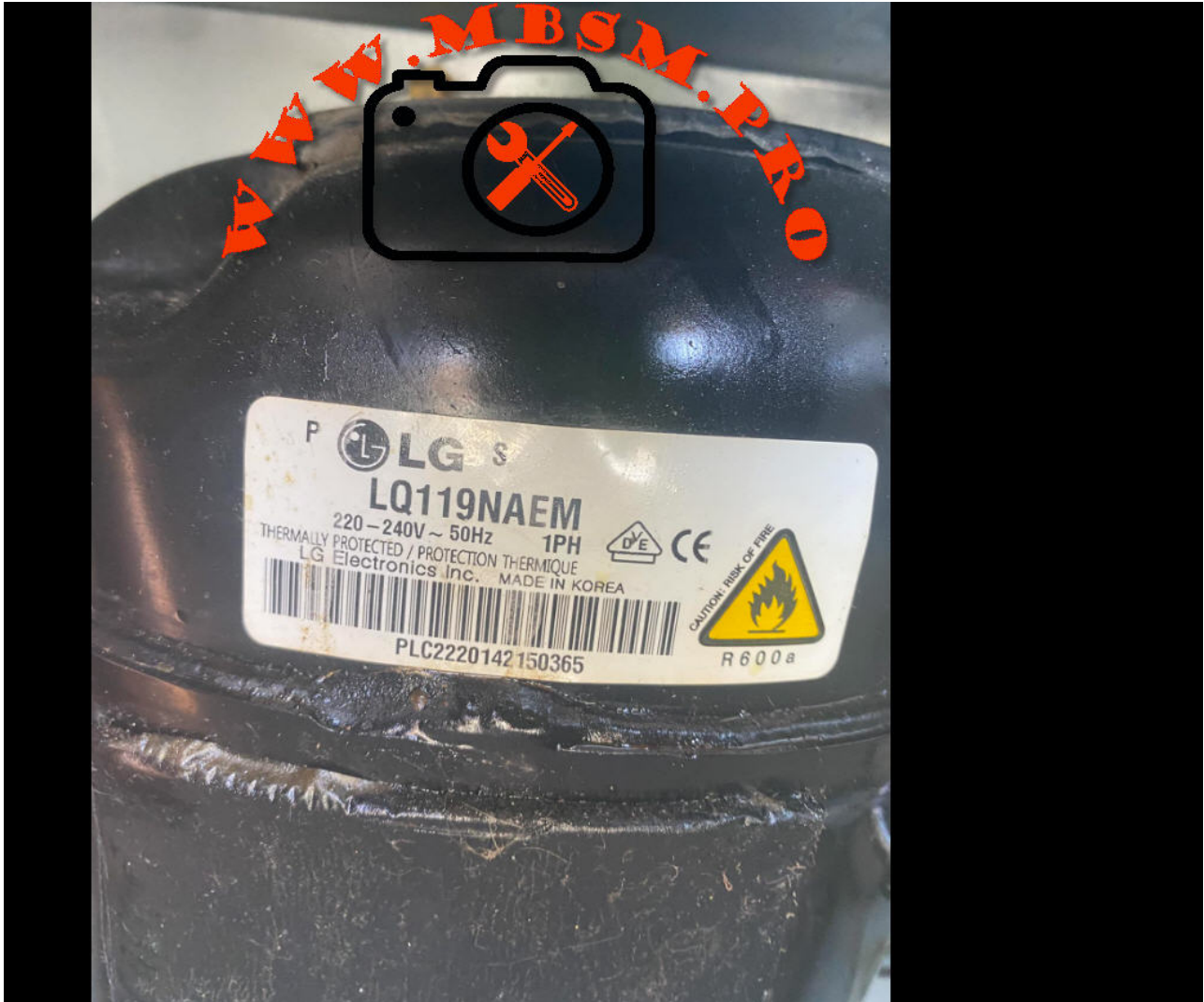
Mbsm.pro, Lg, compressor, LQ119NAEM, 1/3 hp, 227 w, lbp, 774 btu, r600a

Mbsm.pro, 1/2HP, LG, Commercial, Freezer, Compressor ,Lx110lajm, SC21G, r134a