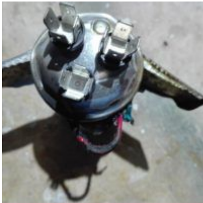
mbsm-dot-pro-capacitor-explodes- Pictures-C.jpg (1 MB)