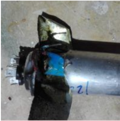
mbsm-dot-pro-capacitor-explodes- Pictures-B.jpg (1 MB)