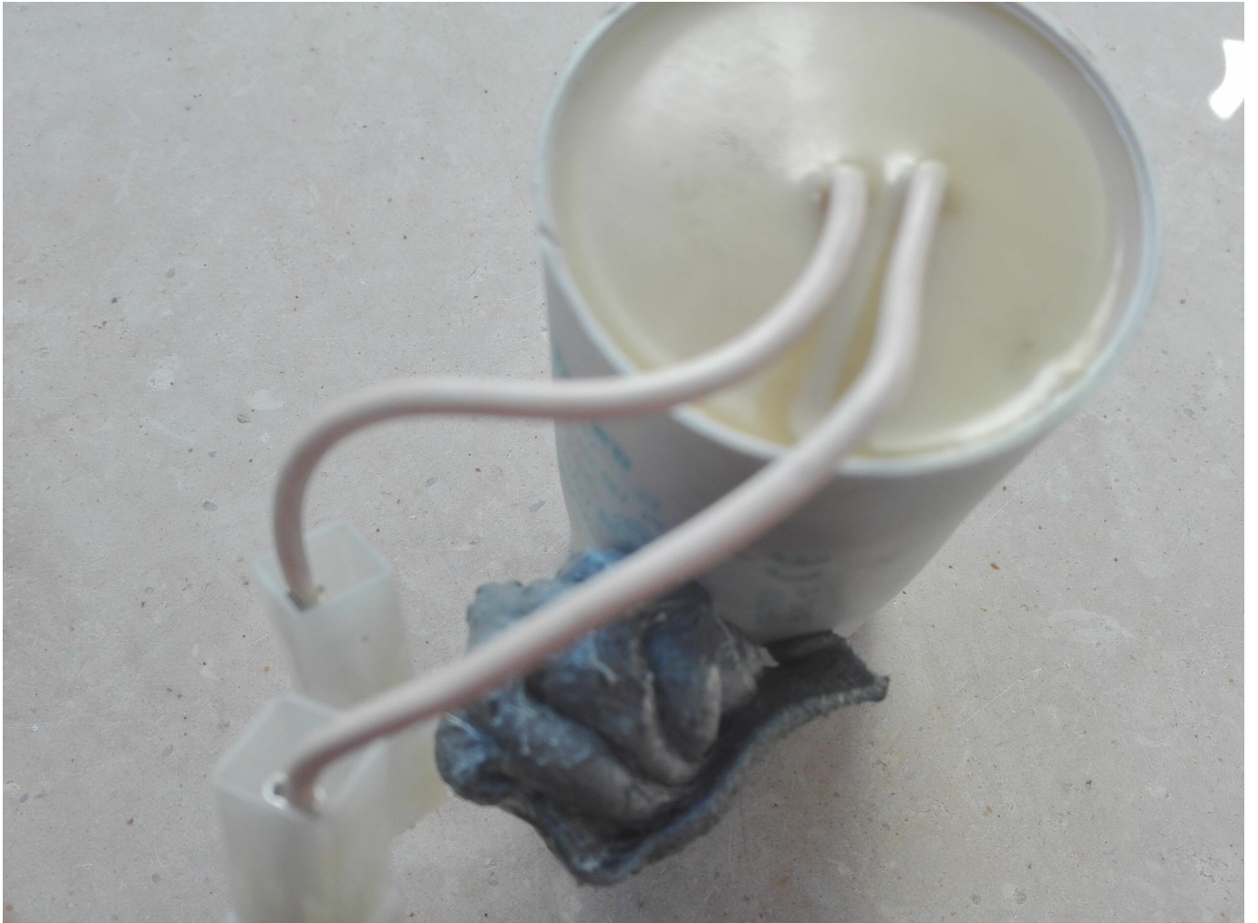
mbsm-dot-pro-capacitor-explodes- Pictures-I.jpg (1 MB)