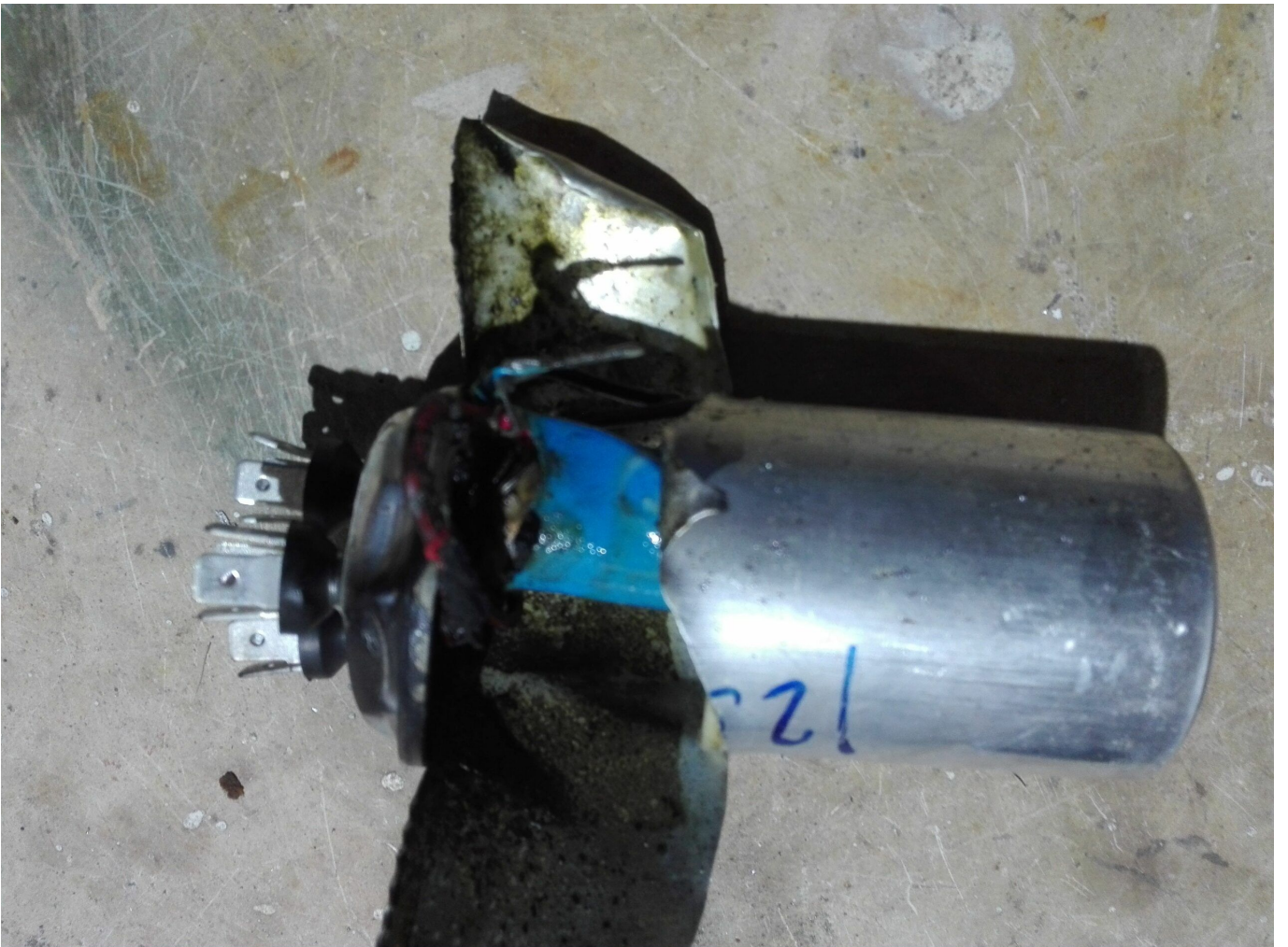
mbsm-dot-pro-capacitor-explodes- Pictures-B.jpg (3 MB)