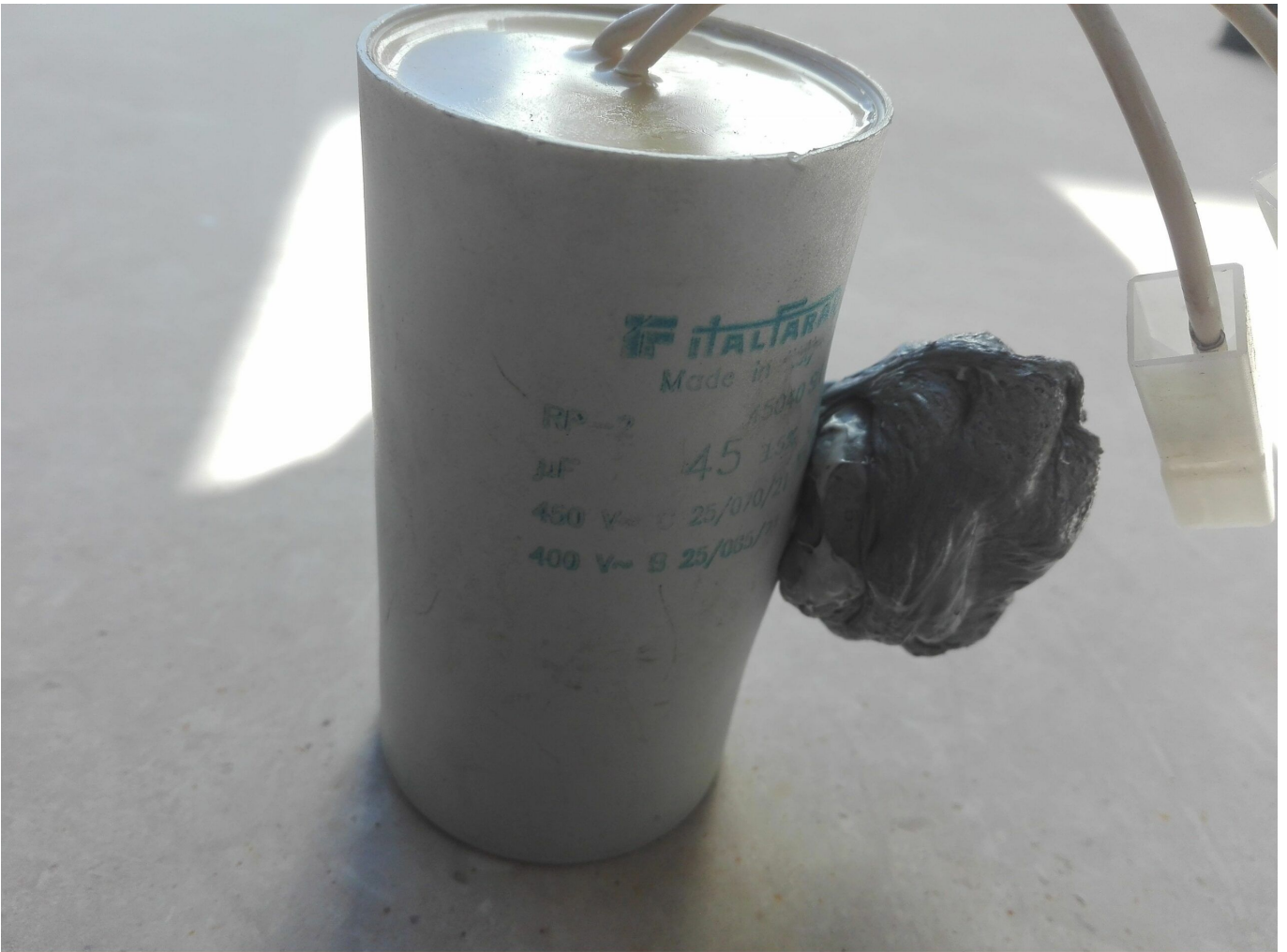
mbsm-dot-pro-capacitor-explodes- Pictures-F.jpg (748 KB)