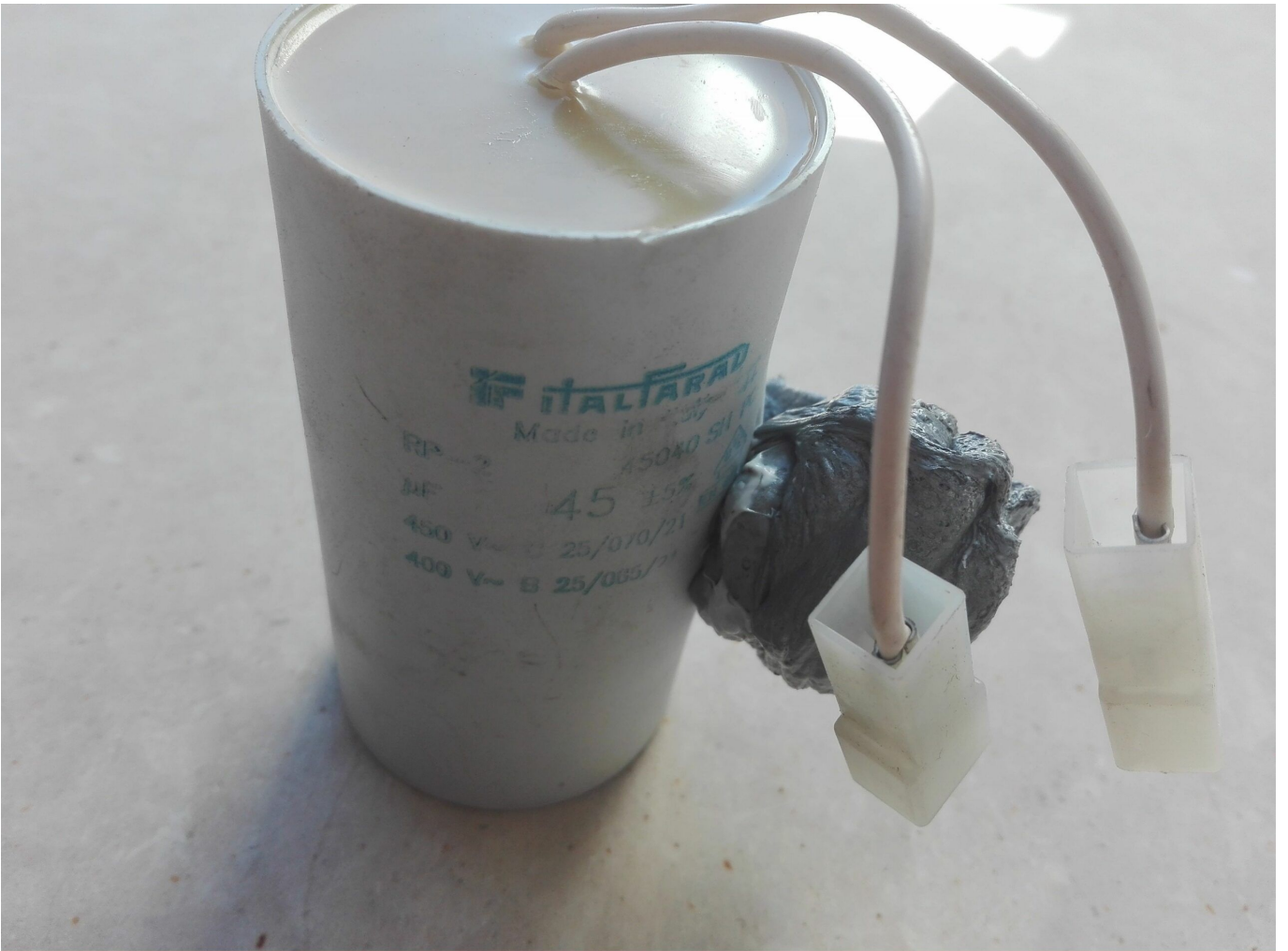
mbsm-dot-pro-capacitor-explodes- Pictures-J.jpg (739 KB)