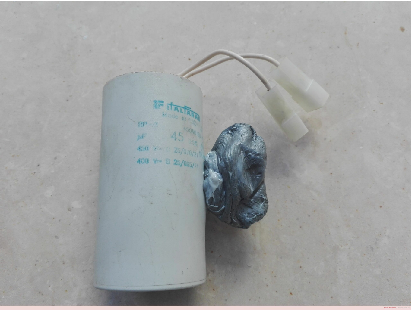
mbsm-dot-pro-capacitor-explodes- Pictures-G.jpg (2 MB)