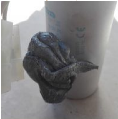
mbsm-dot-pro-capacitor-explodes- Pictures-H.jpg (690 KB)