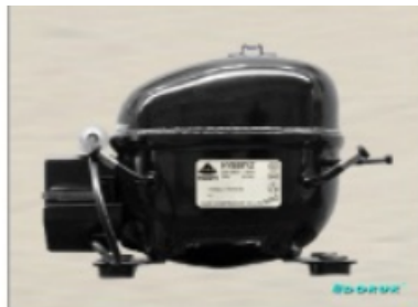
AE 1350 Y