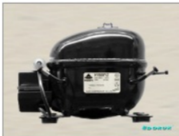
HYE 55 YL 63