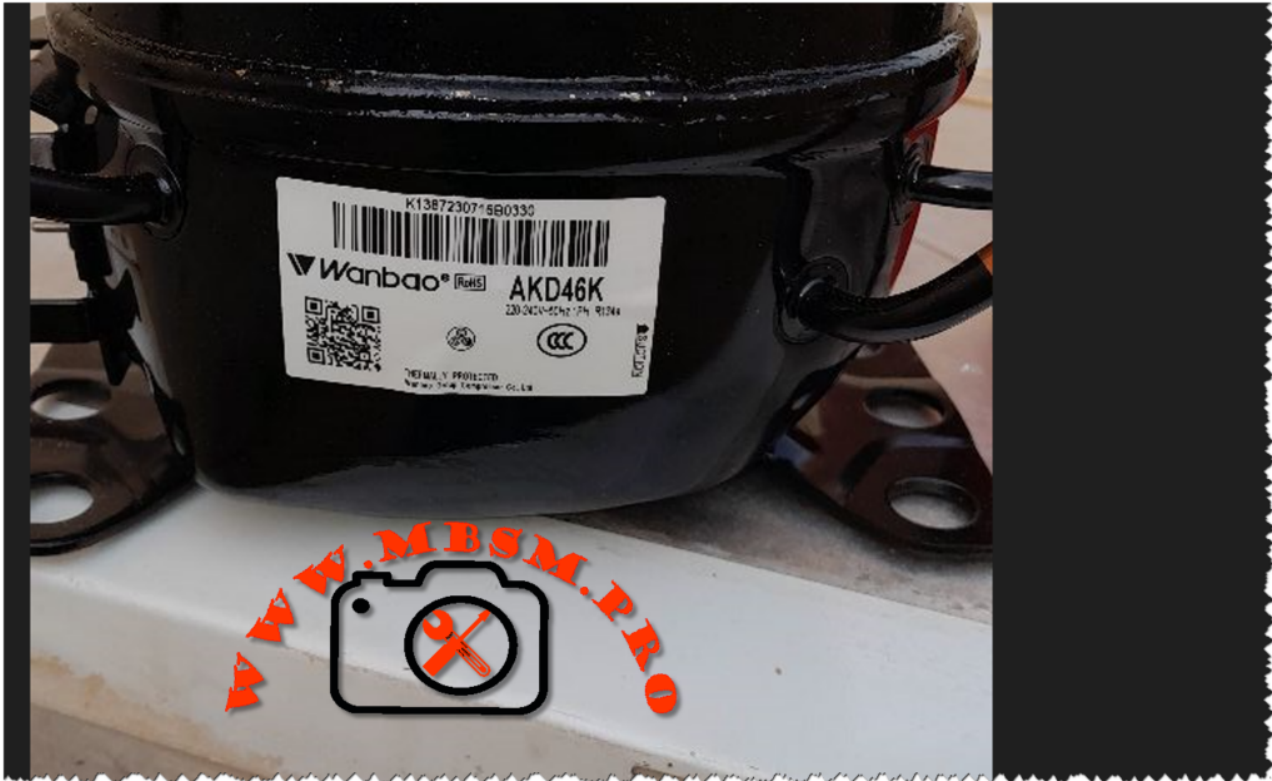
Mbsm.pro, compressor, AKD46K, 114 w, r134a, Wanbao compressor, 1/8 hp, lbp