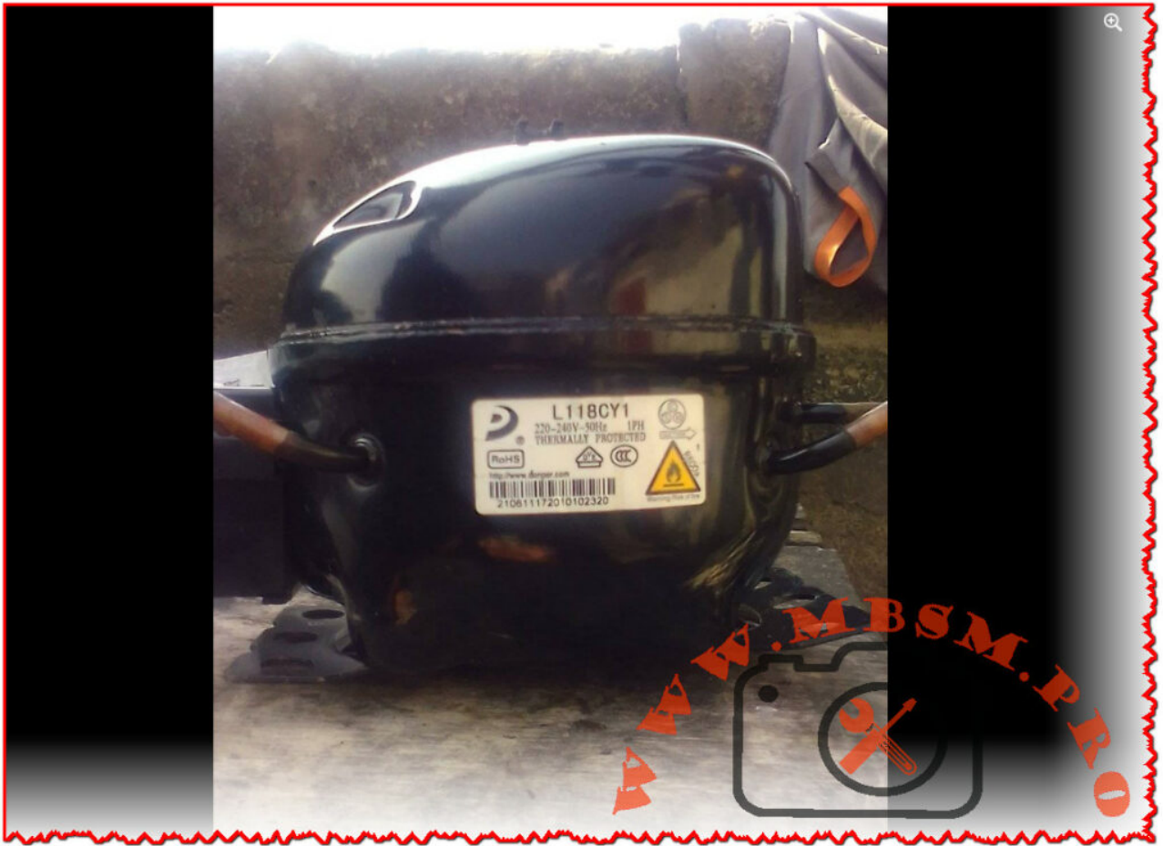
Mbsm.pro, compressor, L118CY, 193 w, r600a, 1/4 hp, 220-240V 50Hz, 1PH, LC-318, LC-368