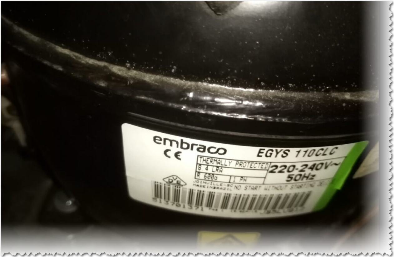
Mbsm.pro, Compressor, Embraco, EGYS110CLC, 1/3 hp, lbp, r600a, 263 w, 1.1a

Mbsm.pro, Lg, compressor, LQ119NAEM, 1/3 hp, 227 w, lbp, 774 btu, r600a