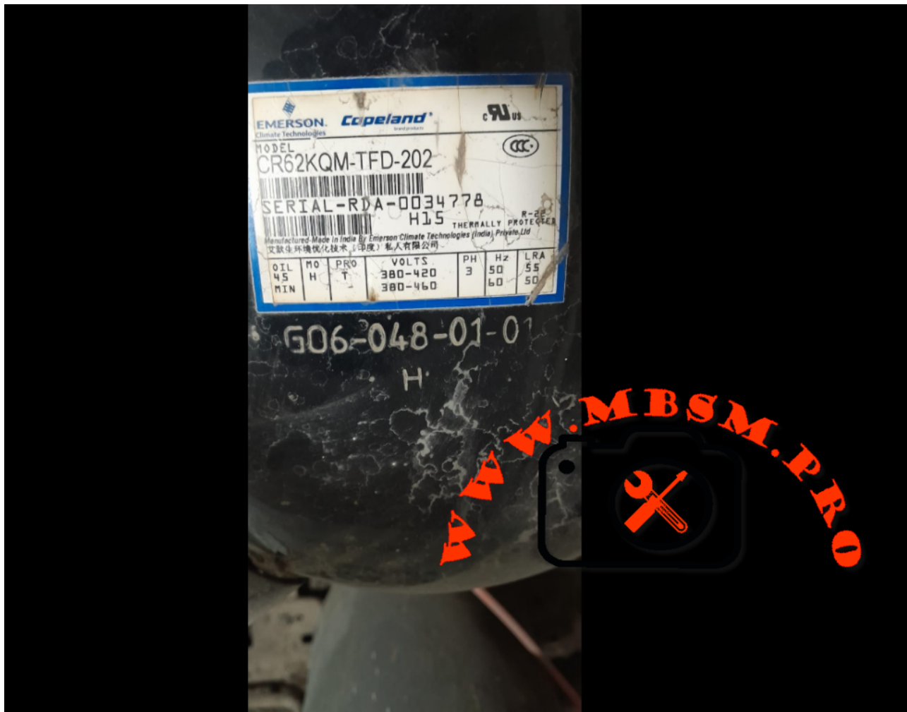
Mbsm.pro , Compressor, CR62KQM-TFD-202, Copeland, Hermetic, 5 hp, 3ph

Mbsm.pro, Compressor, hkk95aa, 220-240/50 1/5hp, 167w, R600a, 1bp