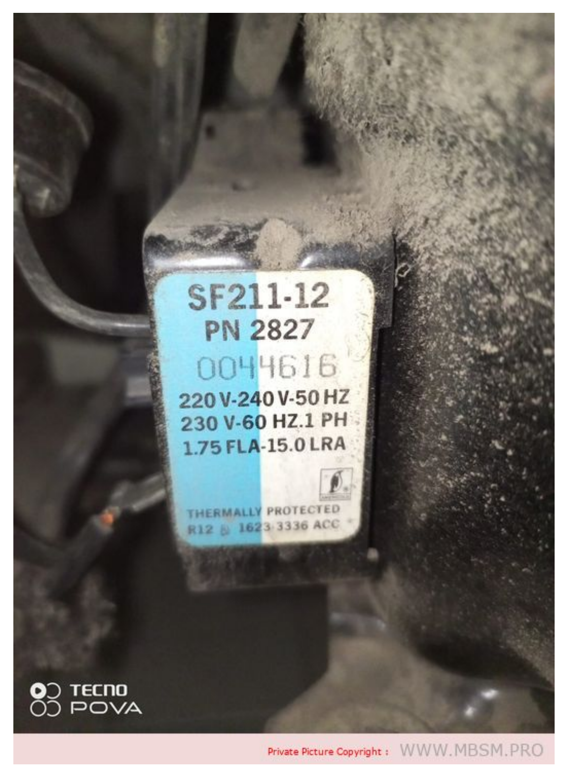
Compressor, SF211-12, Pn2827, 1/3 hp, r12, 1100 Btu/h, 233 w, 1.75 A FLa, 15 A LRA, 220 v / 50 Hz, LBP