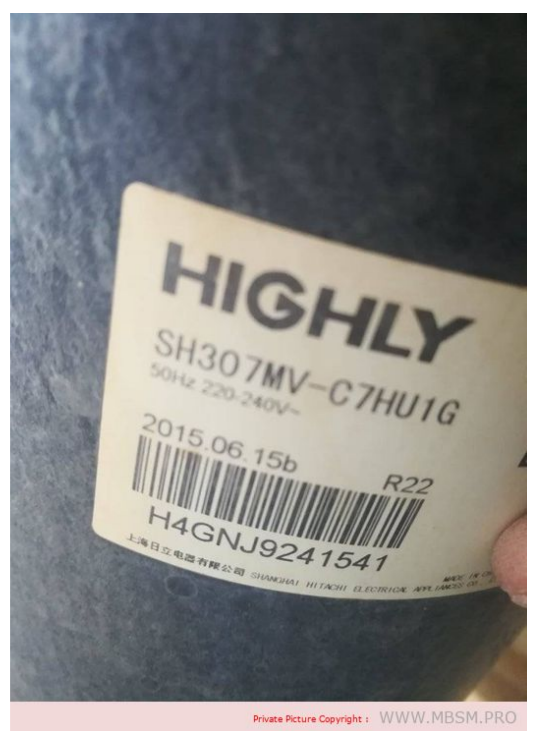
Compressor, sh307mv-c7hu1g, sh307mv, r22, 1 ph, 6000 w, 18000 btu/h