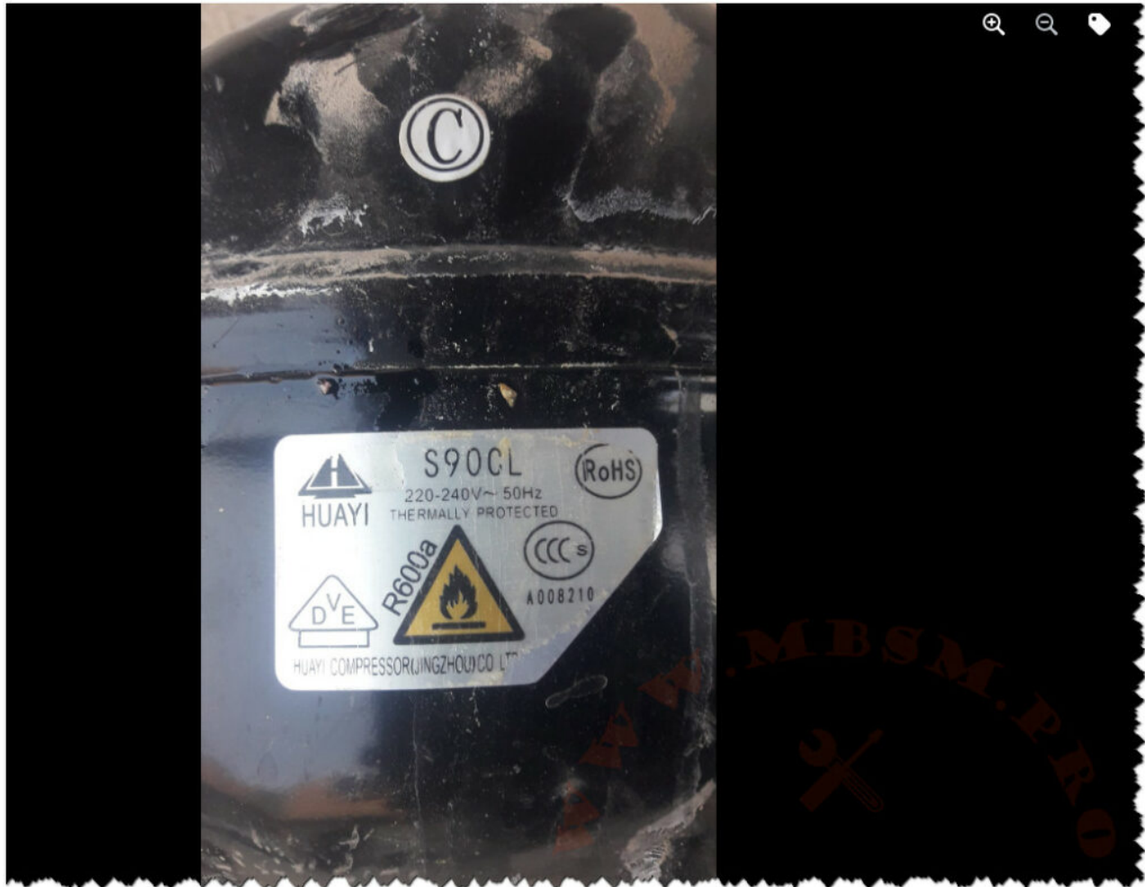
Mbsm.pro, compressor, HUAYI, S90CL, 1/5 hp, r600a, lbp, 155 w, 9 cm3

Mbsm.pro, Compressor, ML52-1A, PN 2725, r12, QB66C13GAX5, 1/5 hp, r134a, freezer, 6 raks