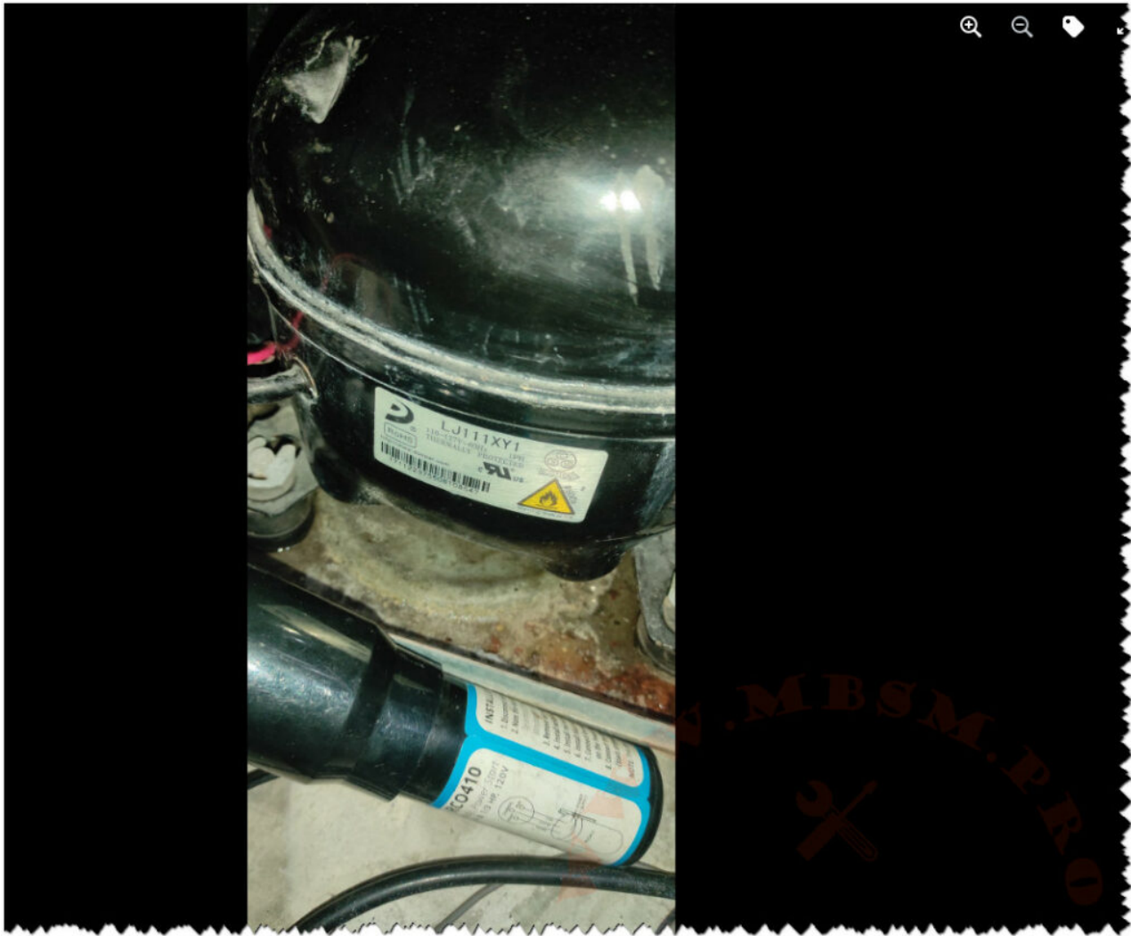
Mbsm.pro, Compresor, 1/4 hp, 11 cm 3 , r600a, Daewoo, Lj111xy1, 186 w, lbp

Mbsm.pro, Panasonic, Compressor, D Series, DD86C23GAX6, 1/3 hp, 300 w, lbp, r134a, 8.6 cm 3