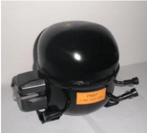
Mbsm.pro, Fn Series, Compressor, FN75H, Refrigerator, 1/6HP, R134A, 130W

Mbsm.pro, Gree, air conditioner, GWHD(14)NK6L0(LC)(LH), GWHD(14)NK6L0, CB228W08401, CB228W08400, 14000 btu, Inverter Rotary, Compressor, QXA- B141zF030A, 2 hp-, 1440 w, I ra 25 A, DC block controller, r410a, 220 v, 50 hz, 900 to 7200 RPM