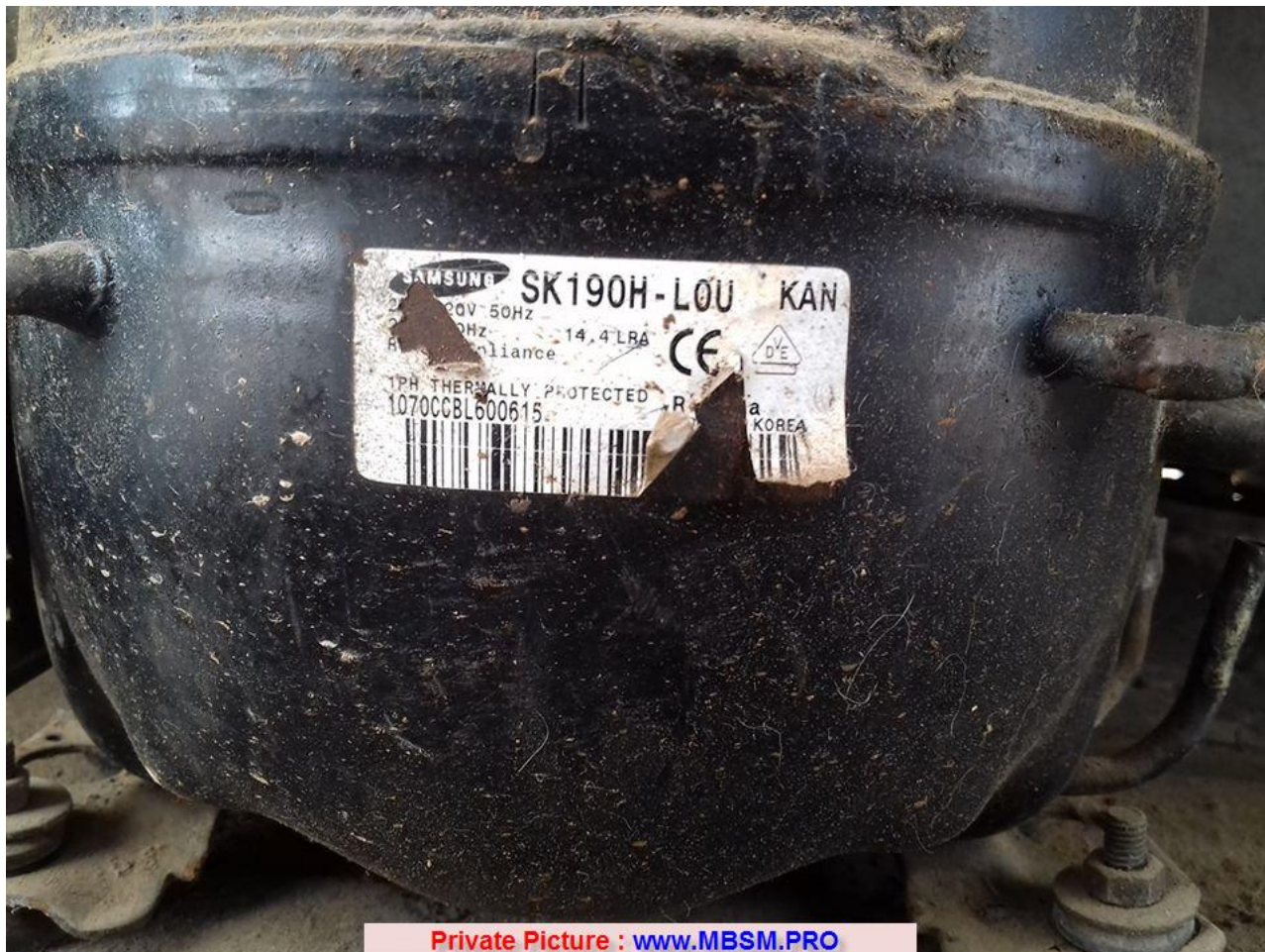
Bocha Samsung Sk190h 1/3 Hp R134