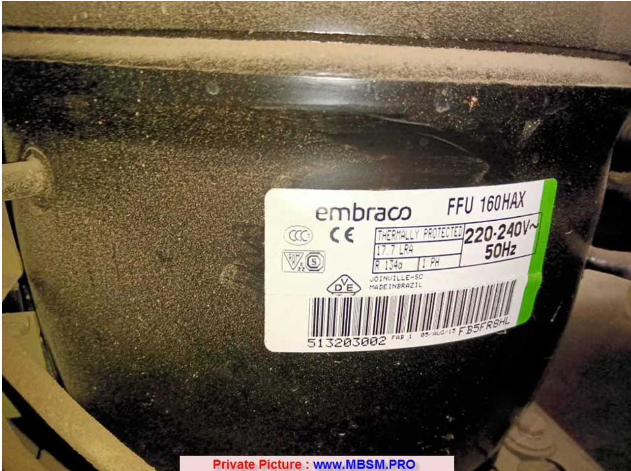
Compresor Embraco, T/M-B FFU160HAX 1/2 HP, 1,533 BTU/h, R-134 A ,MBP

Category: Technologie, Tester ok written by www.mbsm.pro | 3 May 2020